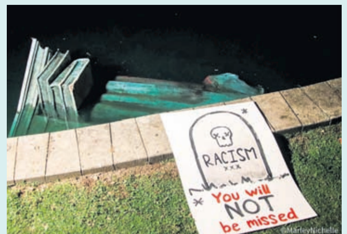
A statue of Christopher Columbus is in the water at Byrd Park in Richmond, Va. Tuesday, June 9, 2020, after it was torn down by protesters.

"Most serving soldiers know little about the history behind the Confederate leaders for whom these bases are named, or the political deals that caused them to be honored in this fashion," he said. "There might be some pushback from a small segment of soldiers from the South, but this is what we like to call a 'teachable moment.' Now is the time to finally bring about a change that will speak volumes as to what the U.S. Army stands for." □